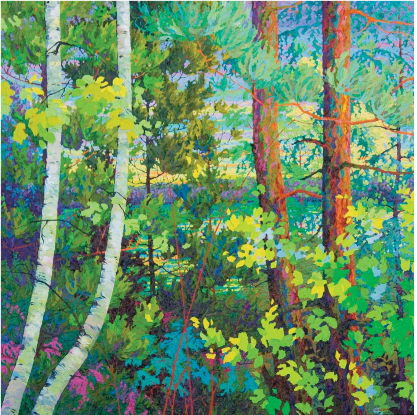
GLIMPSE OF DEER ISLAND, OIL ON CANVAS, 4 X 4'

These paintings of vivid colors and abstracted organic shapes take the viewer on visual adventures where their eyes are excited by discovery of elements such as fine tendrils of brilliant red saplings weaving through rich greens and turquoise undergrowth.