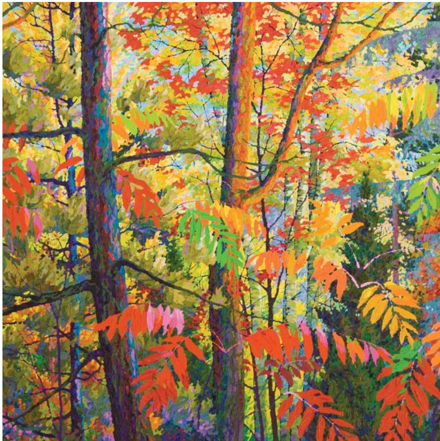
RED SUMAC II, OIL ON CANVAS, 4 X 4'

Much of the new work was inspired by a recent painting trip to Michigan's Upper Peninsula where Balaam became fascinated by the glimpse of hidden lakes through the trees and the amazing autumnal color changes prominently seen in the brilliant red Sumacs.