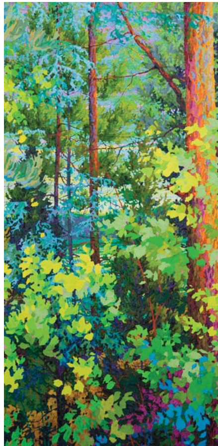
MINERAL LAKE, OIL ON CANVAS, 54 X 32'